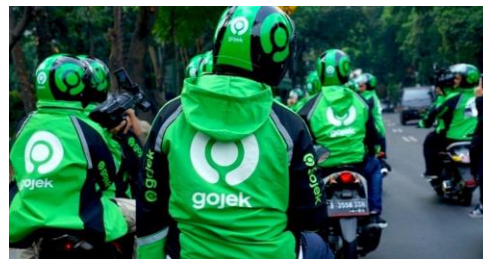
Gojek employees on motorbikes on the streets of Indonesia

In recent years, Gojek has acquired a number of financial technology companies, including payment gateway Midtrans. The acquisition has helped Gojek to build its payment ecosystem, which is targeted towards business owners and merchandisers, with the goal of providing a holistic solution for merchandisers to grow their businesses. As of today, Gojek's payment solution, GoPay, is available in Indonesia, Thailand and Philippines. More than half of all transactions made on Gojek is done through GoPay, while over half a million of merchandisers accepts it as a payment form in physical store. Now, with its new investors, there are new room for expansion. Analysts point out that Gojek will be able to embed Facebook's digital wallet on its platform, attracting even more merchandisers and customers.