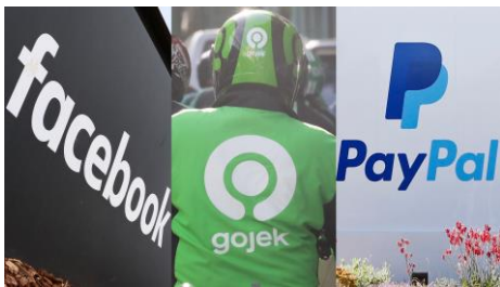
Facebook and PayPal invest in Indonesian ride-hailing firm Gojek, joining previous investors such as Google and Tencent.

Further, Gojek also said that the collaboration with PayPal will enable users of the digital wallet to access American firm's network of more than 25 million merchants worldwide.