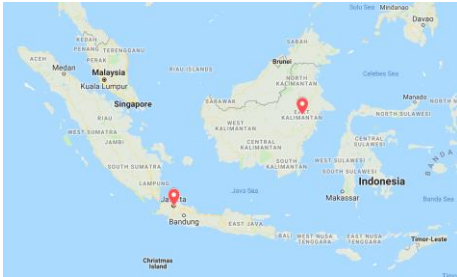
Locations of Jakarta and the New Capital

In August 2019, the Indonesian Government announced plans to move its current capital from Jakarta to the province of East Kalimantan on Borneo island. According to the National Development Planning Minister Bambang Brodjonegoro, the plan to move the capital would be completed within five years. The decision has instantly caused arguments among the public.