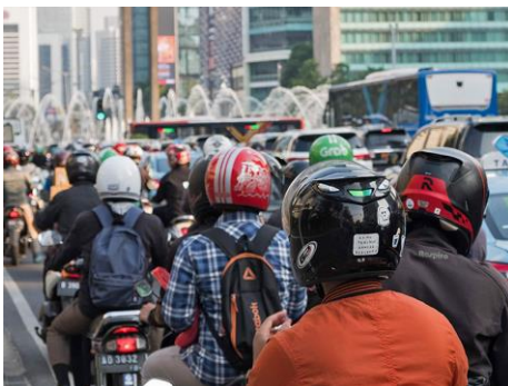
Traffic Jams have always been one of the greatest concerns for citizens in Jakarta

As any other capital city, Jakarta is under the constraints of rapid urbanization and overpopulation. The negative effects of Jakarta's traffic congestion and pollution are estimated to cost the economy USD 10 billion annually. Moreover, as a result of groundwater drilling and the sheer weight of skyscrapers, Jakarta is sinking at one of the fastest rates in the world (95% of the northern part is expected to be underwater by 2050). Besides, Indonesia is made up of 18,000 islands, but more than half of the population live on the Java island, where Jakarta is located. Wealth has historically been concentrated there as well, despite the natural resource riches of its outer regions. Therefore, moving the capital is expected to even out the social polarization and support more balanced regional development.